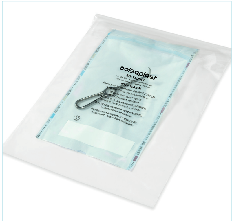
Totally transparent, to see product inside without opening bag. Perfect view of inside packaging. A white square is printed, so user can write in