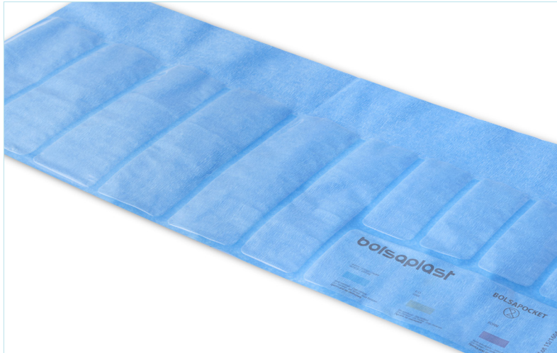
Pockets perfectly located for an easy introduction of tools. Several window sizes to make it easy to use. Printed with indicators for Steam, ETO and Formaldehyde