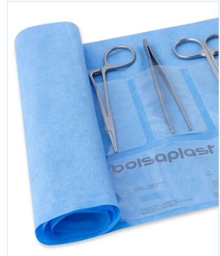
Soft and malleable material, to easy fold it without any marks